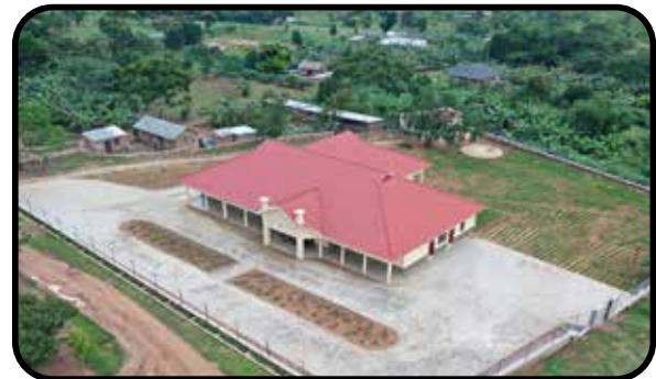
New Birthing Center