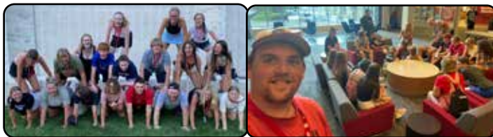
15 high school students from LCM participated in the MOVE Conference at UNL. Thanks to our small group leaders who went along with these amazing teens!

Sunday mornings for middle and high school students begins on Sunday, Sept 11th from 9:40 - 10:20am. Join us Sundays for Bible Study and Service Projects.