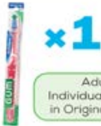
Adult-Size Individual Toothbrush in Original Packaging