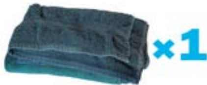
Dark Color Bath-Size Towel 20"×40" or 52"×27"

LCM will be collecting items to make LWR Care Kits now through October. One LWR Care Kit contains the following: