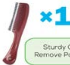
Sturdy Comb, Remove Packaging