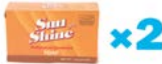
Bath-Size Soap Bars (4 or 5 oz) in Original Wrapping