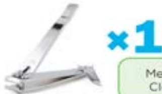
Metal Nail Clippers